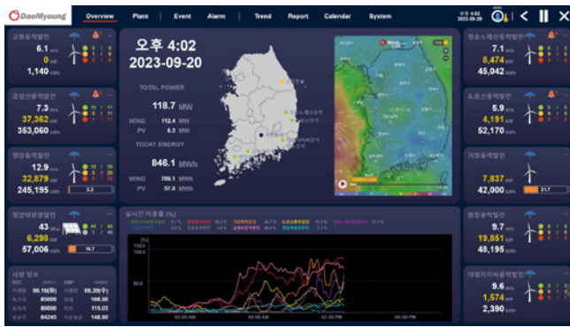
Overview of the performance of the nine dispersed wind and solar power plants.