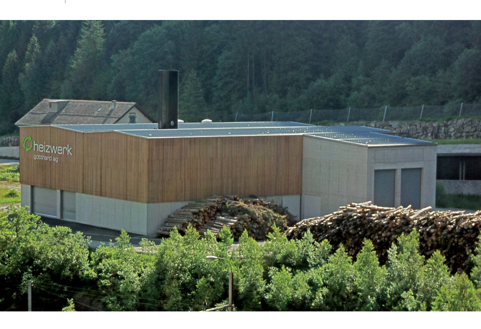
heizwerk gotthard ag heats Andermatt ecologically