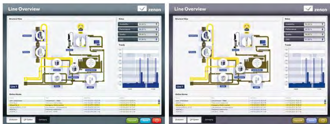
Figure 5: Original screen with zenon skin "Color Corrected" (left) and hence improved Deuteranope-perception (simulated, right)