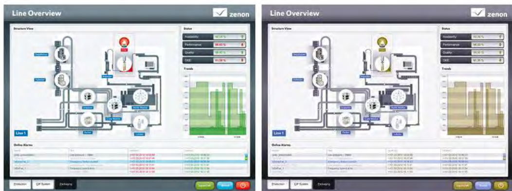
Figure 3: Original screen (left) and simulated perception (right) with red-green visual impairment (Deuteranope)

Habit and knowledge of the position of important elements help signals to be interpreted correctly. But in everyday working situations, it makes a clear difference if the status of equipment can be recognized immediately or if it must first be decoded from symbol form. It is better, safer and more productive to provide users with their own color scheme with color tones that are more clearly and easily distinguishable for them.