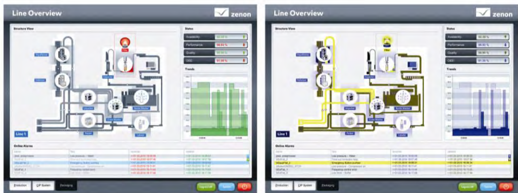
Figure 4: Original screen (left) and the same screen with adapted color palette for users with red-green visual impairment (right)

Habit and knowledge of the position of important elements help signals to be interpreted correctly. But in everyday working situations, it makes a clear difference if the status of equipment can be recognized immediately or if it must first be decoded from symbol form. It is better, safer and more productive to provide users with their own color scheme with color tones that are more clearly and easily distinguishable for them.