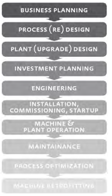
Figure 1: Each Food & Beverage Production Plant follows its own life cycle.

From this moment on, engineering is a key task within the factory life cycle. For the purposes of this document, we concentrate in particular on software engineering for process and factory automation.