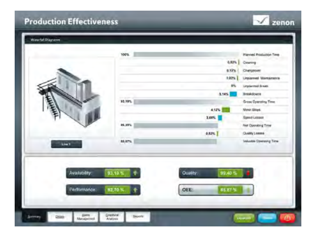
Figure 4: Using zenon, the calculation and display of real time performance indicators is made possible without programming – simply by means of setting parameters.

Using the graphical elements in zenon, information is presented to the user very clearly: numerical values, bar graphs, trend curves or waterfall diagrams, for example, ensure data is understood quickly and clearly. Real-time information makes it possible for the Production team to react to any change quickly and appropriately.