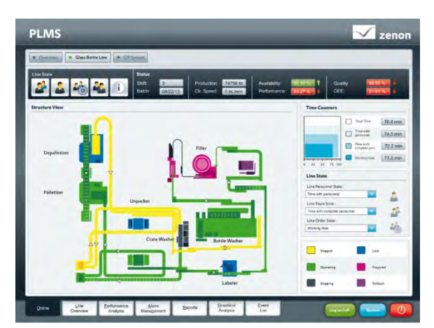
Figure 5: With little engineering effort, zenon brings the right information to the right people via the network.

Screens that may be required for equipment operators (for example, to display the causes of downtime via the