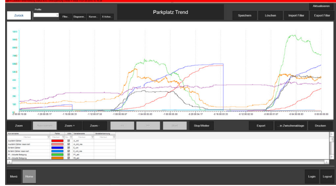
The parking space capacity is displayed graphically for specific time periods.