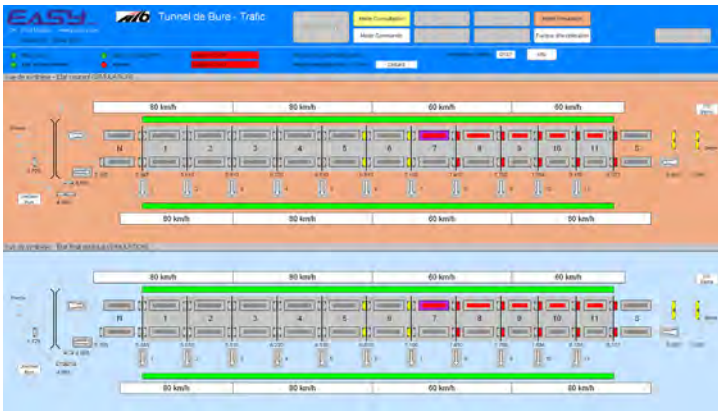
"Bure" tunnel: View of the speed segments