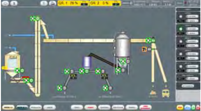
Raw material (straw) granulation process..