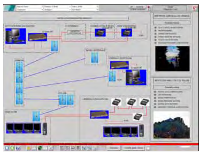
Energy distribution control screen