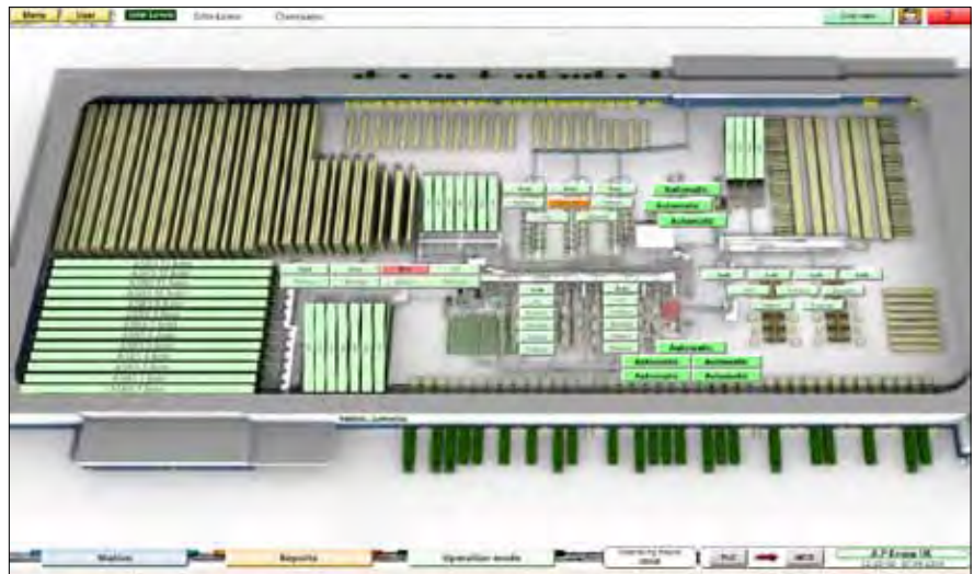
An overview of the complete conveyor facilities: All processes in the new high bay facility at John Lewis are visualized and controlled with zenon.