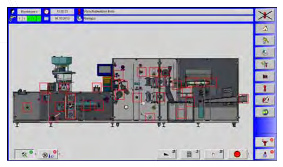
Using zenon, Romaco can fulfill present and future customer requirements – without compromise – and offer maximum flexibility at the same time.

by defined guidelines from the U.S. Food and Drug Administration (FDA) requires that electronically saved data are subject to the same standards as paper documents. This covers, amongst other things, production protocol, information regarding quality management, as well as the archiving of these documents and data. Romaco achieves compliance to these standards with the help of the Chronological Event List in zenon. The Chronological Event List defines all interventions to the program or the data set. Romaco customers can thereby gain a filtered view – in the Runtime – of all relevant events of a machine or piece of equipment, and document these. This includes, for example, process events, value changes, overrunning limits or user input. These audit trails can be archived and analyzed according to diverse criteria – whilst being continually protected from manipulation.