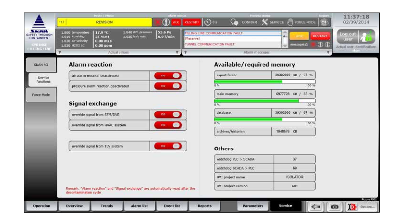
Everything under control: The internal zenon variables clearly display important information, such as watchdog or available memory space.

high level of availability in production and ergonomic and rapid diagnosis is particularly important for the user. Compliance with FDA/GMP guidelines is mandatory. Furthermore, we lay great importance on contemporary usability, for example, through Multi-Touch operation, and visualization that can be handled without much extra coding in complicated language or software from other manufacturers." This is why a high level of importance has been given to user guidance. The clear equipment screens ease orientation and help with fault locating. Important information is prominently displayed. And for necessary entries the rest of the monitor is dimmed and the operator's attention is directed to the element which requires action.